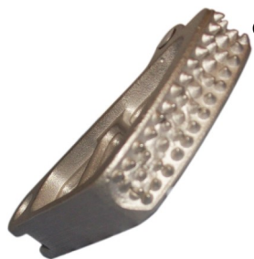
Coned Cam Profile for minimal rope wear.