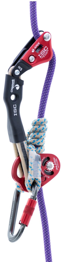
Chipmunk FLEX 9" Tether Cordage & Hitch configuration shown for illustration, only.