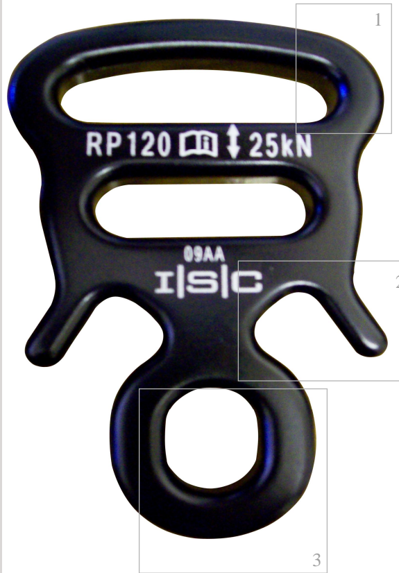
RP120> MINI FIGURE 8.

ISC MANUFACTURES AN EXTENSIVE RANGE OF ASCENDERS AND DESCENDERS FOR USE ON A WIDE VARIETY OF ROPES. ALL ASCENDERS AND DESCENDERS CONFORM TO RELEVANT EUROPEAN AND ANSI STANDARDS.