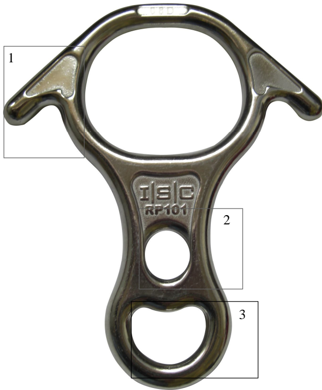
RP101 > Stainless Steel RESCUE FIGURE OF 8,

ISC MANUFACTURES AN EXTENSIVE RANGE OF ASCENDERS AND DESCENDERS FOR USE ON A WIDE VARIETY OF ROPES. ALL ASCENDERS AND DESCENDERS CONFORM TO RELEVANT EUROPEAN AND ANSI STANDARDS.