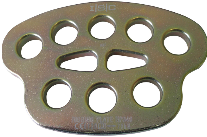
RP340 > STEEL MEDIUM RIGGING PLATE,

ISC MANUFACTURES AN EXTENSIVE RANGE OF ANCHOR DEVICES ALL ANCHOR DEVICES CONFORM TO RELEVANT EUROPEAN AND ANSI STANDARDS.