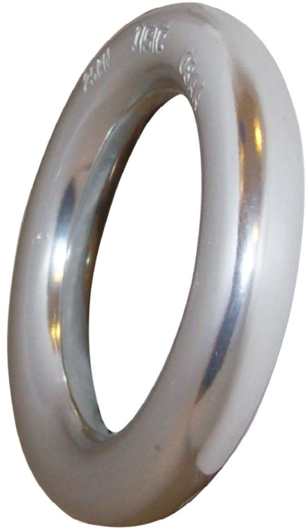
RIN0011A > LARGE ALUMINIUM RING.