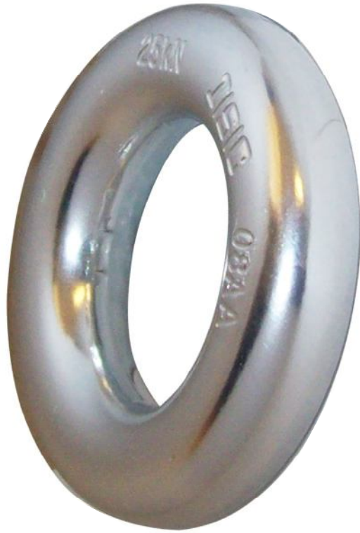
RIN0010A > SMALL ALUMINIUM RING.