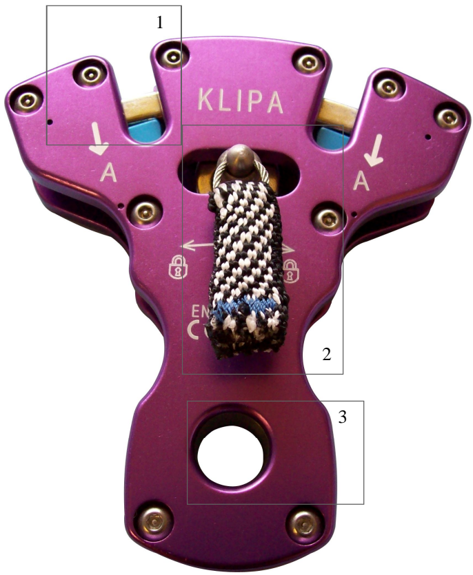
RP410 > KLIPA - in line connector

ISC manufactures an extensive range of anchor devices. All anchor devices conform to relevant EUROPEAN and ANSI standards.