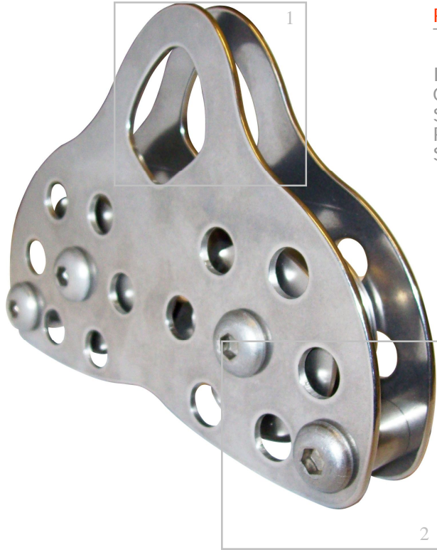
RP036 > STANDARD STAINLESS STEEL TANDEM PULLEY.

ISC MANUFACTURES AN EXTENSIVE RANGE OF STAINLESS STEEL PULLEYS. ALL STAINLESS STEEL PULLEYS CONFORM TO RELEVANT EUROPEAN AND ANSI STANDARDS.