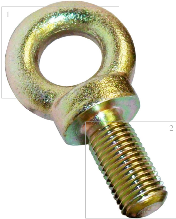
EYE0013A> STEEL EYE BOLT.

ISC MANUFACTURES A RANGE OF HARNESS COMPONENTS. ALL COMPONENTS CONFORM TO RELEVANT STANDARDS.