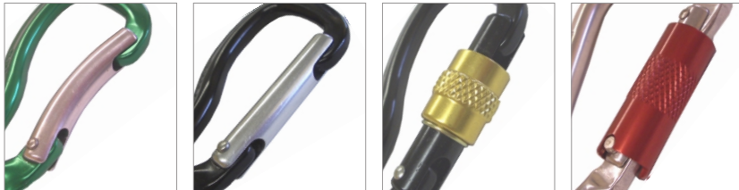
BENTGATE PLAINGATE SCREWGATE SUPERSAFE

FINISH > ANODISED QUALITY > 100% INSPECTED WEIGHT > 53G