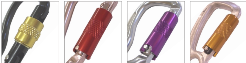
SCREWGATE SUPERSAFE QUADLOCK TWISTLOCK

MATERIAL > FORGED 7075 ALUMINIUM PROOF TESTED > 16KN MINIMUM BREAKING LOAD > GATE CLOSED - 30KN APPROVED STANDARDS > CERTIFICATED TO PPE DIRECTIVE 89/686/EEC & BS EN362 .BARRELS MANUFACTURED TO Z359-1. FINISH > POLISHED OR ANODISED QUALITY > 100% INSPECTED WEIGHT > 99G